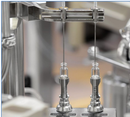
© Vetter Pharma International GmbH: Supporting efficient drug development with dedicated clinical development expertise.

Find the Vetter press kit and more background information here .